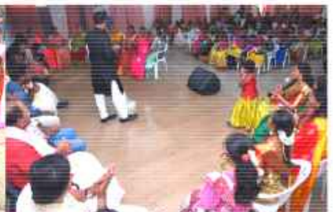
Faculty actively participating in Anthyakshari