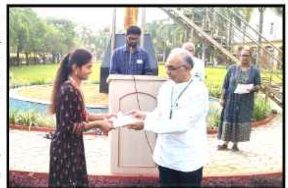
Student receiving merit scholarship