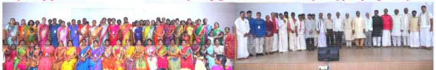
Faculty in traditional wear