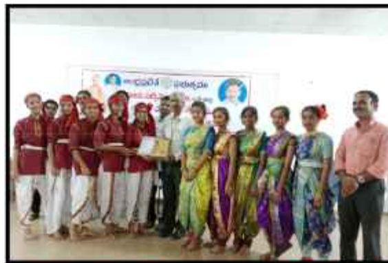
Our students in the National Youth Festival-2024