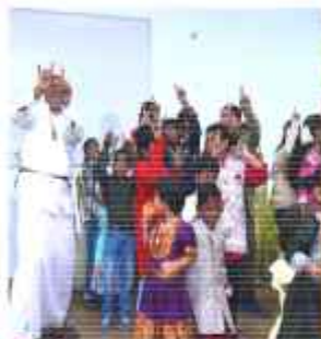
Faculty encouraging kids to dance

An In-House Faculty Get-Together was organized in the college on 13 January 2024. The entire faculty actively participated in cultural activities and games. Faculty members sang songs, and the Principal's skit made the day memorable. Children danced to the music, and kites were flown. Traditional food was served throughout the day, including snacks, refreshments, and lunch.