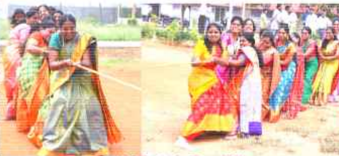
Female Faculty in Tug off War