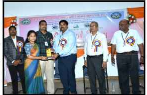
Year-wise prize distribution for toppers