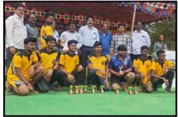
Ball Badminton-JNTUK Central zone