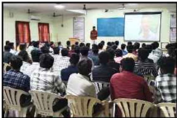
A talk by an alumnus