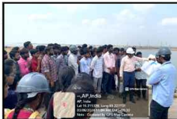
Students at Machilipatnam Port