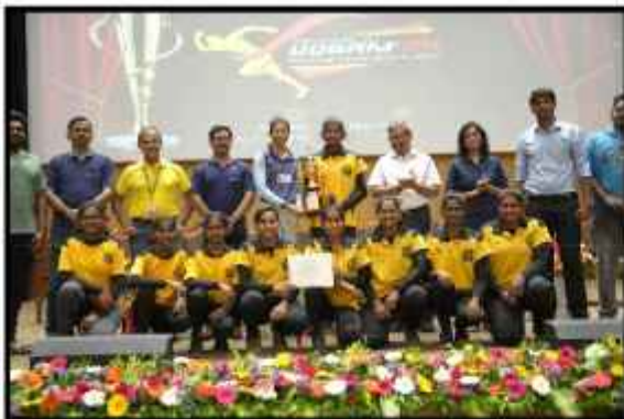
Volleyball winners at SRM-AP National fest